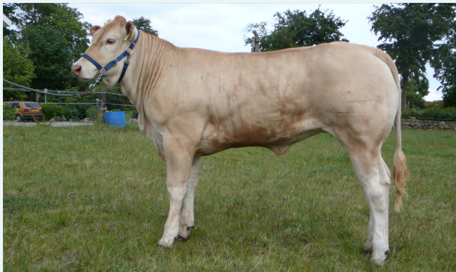
Heifer No 59523-00343, BABS Dolly Pp, after Simon pp and Beatrice PP is a good example of the new generation of polled pedigree breeding animals from BABS PolledBlonde.

Follow the performance testing at http://www.polledblonde.dk .