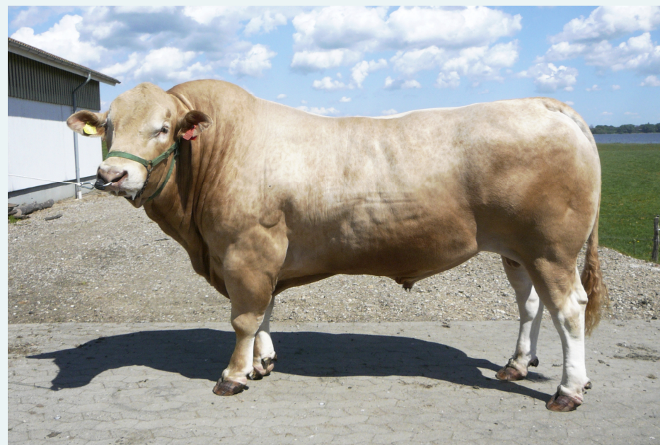
BABS Adventius PP after GG Ursus Pp and VBQ Thiamin Pp – PGD: GG Ninka